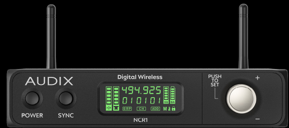
NCR1 Front Panel